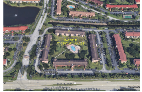
Built in 1993 - 192 units - 4 floors