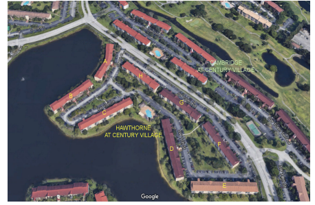
Built in 1989 - 416 units - 4 floors

Century Village Pembroke Pines 13800 SW 5th Ct, Pembroke Pines, FL 33027 (954) 431-2137