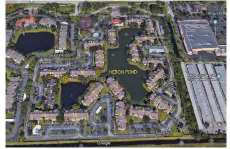
Built in 1989 - 304 units - 2 floors

Heron Pond Address: 8320 SW 1st St, Pembroke Pines, FL 33025 Phone: +1 954-251-2593