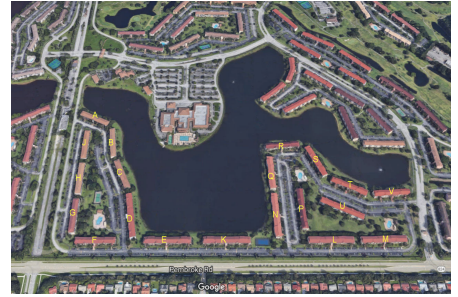
Built in 1992 - 688 units - 4 floors