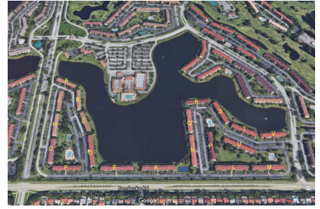
Built in 1992 - 688 units - 4 floors