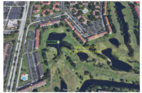
Built in 1984 - 616 units - 4 floors

Number of units: 616 Number of active listings for rent: 7 Number of active listings for sale: 30 Building inventory for sale: 4% Number of sales over the last 12 months: 27 Number of sales over the last 6 months: 13 Number of sales over the last 3 months: 7