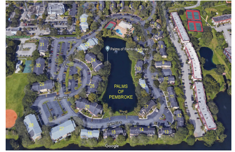
Built in 1991 - 348 units - 3 floors

Palms of Pembroke Pines Address: 9450 Palm Cir N, Pembroke Pines, FL 33025 Phone: +1 954-450-5800