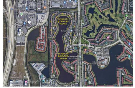
Built in 1993/1997 - 492 units - 4 floors

Century Village Pembroke Pines Address: 1551 SW 135th Terrace, Pembroke Pines, FL 33027, Phone: +1 954-261-0000 Century Village Address: 13460 SW 10th St, Pembroke Pines, FL 33027 Phone: +1 (954) 866-8915