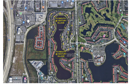
Built in 1993/1997 - 492 units - 4 floors

Century Village Pembroke Pines Address: 1551 SW 135th Terrace, Pembroke Pines, FL 33027, Phone: +1 954-261-0000 Century Village Address: 13460 SW 10th St, Pembroke Pines, FL 33027 Phone: +1 (954) 866-8915