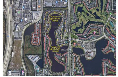
Built in 1997 - 500 units - 4 floors

Century Village Pembroke Pines Address: 1551 SW 135th Terrace, Pembroke Pines, FL 33027, Phone: +1 954-261-0000 Century Village Address: 13460 SW 10th St, Pembroke Pines, FL 33027 Phone: +1 (954) 866-8915