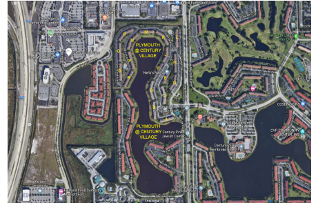
Built in 1997 - 500 units - 4 floors

Century Village Pembroke Pines Address: 1551 SW 135th Terrace, Pembroke Pines, FL 33027, Phone: +1 954-261-0000 Century Village Address: 13460 SW 10th St, Pembroke Pines, FL 33027 Phone: +1 (954) 866-8915