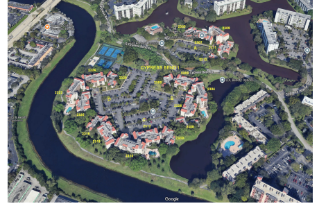
Built in 1973 - 97 units 7 floors

https://kwpmc.com/property/cypress-bend-condominium-i/