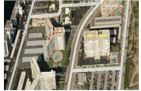
Built in 1969 - 172 units - 16 floors

Jamaica House Association Inc 305 N Pompano Beach Blvd FL 33062 tel 954 943 5869 fax 954 943 8295 email jamaicahousecond@bellsouth.net http://jamaicahousecondo.com/home.htm