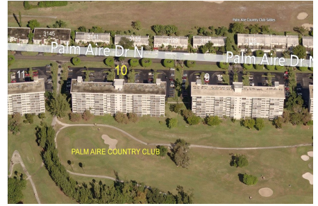
Built in 1970 - 90 units - 9 floors

PALM-AIRE COUNTRY CLUB CONDOMINIUM ASSOCIATION NO 10, INC C/O M&M Property Management LLC 1412 S. Powerline Road Pompano Beach, FL 33069 Office: (954) 582-4400 Fax: (954) 582-4407 http://www.palmaire10.com/palmaire10/