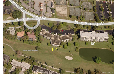
Built in 1980 - 20 units - 2 floors

Mwi/Campbell Management Co, Palm Aire Country Club Condominium Association 3500 Gateway Drive # 202 Pompano Beach, FL 33069-4870 (954) 968-4481