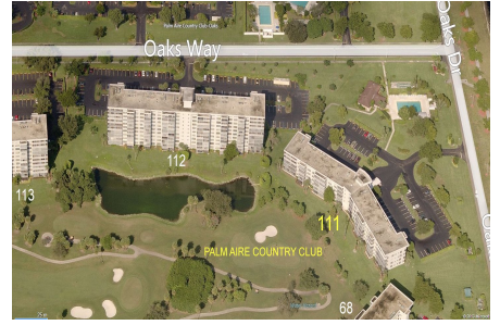
Built in 1980 - 50 units - 5 floors

Palm Aire 2600 Palm Aire Drive North Pompano Beach, FL 33069 Administration: 954-975-6225