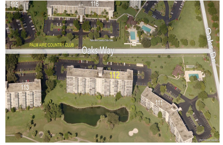
Built in 1982 - 100 units - 10 floors

Number of units: 100 Number of active listings for rent: 0 Number of active listings for sale: 4 Building inventory for sale: 4% Number of sales over the last 12 months: 1 Number of sales over the last 6 months: 0 Number of sales over the last 3 months: 0