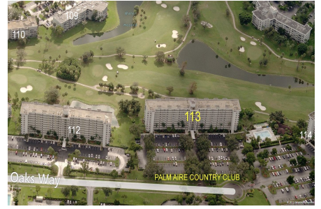
Built in 1982 - 100 units - 10 floors

Mwi/Campbell Management Co, Palm Aire Country Club Condominium Association 3500 Gateway Drive # 202 Pompano Beach, FL 33069-4870 (954) 968-4481