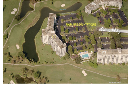
Built in 1982 - 119 units - 10 floors

Number of units: 119 Number of active listings for rent: 0 Number of active listings for sale: 2 Building inventory for sale: 1% Number of sales over the last 12 months: 2 Number of sales over the last 6 months: 1 Number of sales over the last 3 months: 0