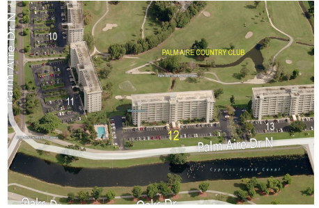
Built in 1970 - 90 units - 9 floors

Palm-Aire Country Club Condominium Association, No. 12 Inc. 3500 Gateway Drive Suite 202 Pompano Beach, Florida 33069 Management Telephone: (954) 968-4481 Maintenance Telephone: (954) 968-4484