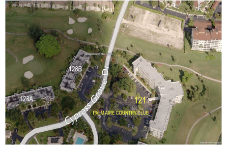
Built in 1980 - 59 units - 5 floors

Palm-Aire BLDG 1218 800 Cypress Grove Drive Pompano Beach FL33069 (954)979-1372