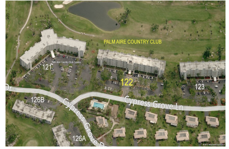
Built in 1981 - 50 units - 5 floors

Palm Aire Building 122 Tropical Coast Management LLC 802 Cypress Grove Lane Pompano Beach, FL 33069-5062 (954) 979-4870