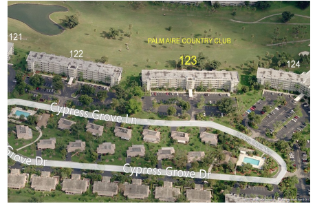
Built in 1981 - 50 units - 5 floors

Palm Aire Building 123 Tropical Coast Management LLC 802 Cypress Grove Lane Pompano Beach, FL 33069-5062 (954) 979-4870