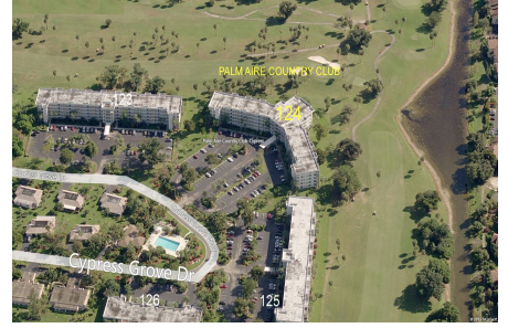
Built in 1981 - 59 units - 5 floors

Palm-Aire Country Club Condominium Association No.12, Inc. 3500 Gateway Drive, Suite 202 Pompano Beach, Florida 33069 Management Telephone: (954) 968-4481 Maintenance Telephone: (954) 968-4484