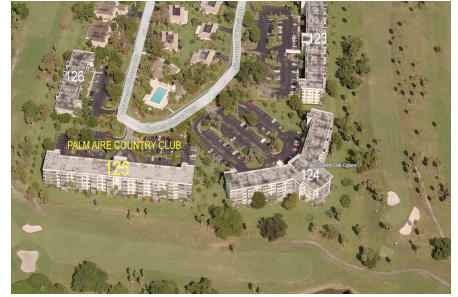
Built in 1980 - 50 units - 5 floors

Mwi/Campbell Management Co, Palm Aire Country Club Condominium Association 3500 Gateway Drive # 202 Pompano Beach, FL 33069-4870 (954) 968-4481