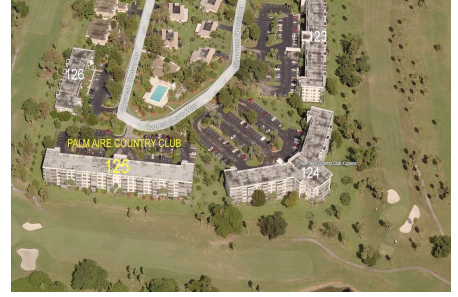
Built in 1980 - 50 units - 5 floors

Number of units: 50 Number of active listings for rent: 0 Number of active listings for sale: 2 Building inventory for sale: 4% Number of sales over the last 12 months: 1 Number of sales over the last 6 months: 1 Number of sales over the last 3 months: 0