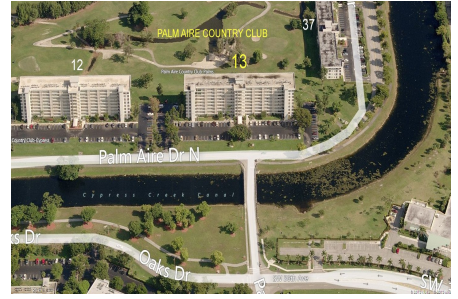
Built in 1970 - 90 units - 9 floors

Palm-Aire Country Club Condominium Association, No. 12 Inc. 3500 Gateway Drive Suite 202 Pompano Beach, Florida 33069 Management Telephone: (954) 968-4481 Maintenance Telephone: (954) 968-4484