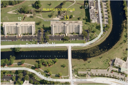
Built in 1970 - 90 units - 9 floors

Palm-Aire Country Club Condominium Association, No. 12 Inc. 3500 Gateway Drive Suite 202 Pompano Beach, Florida 33069 Management Telephone: (954) 968-4481 Maintenance Telephone: (954) 968-4484