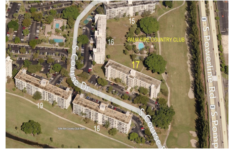
Built in 1971 - 60 units - 6 floors

Palm Aire Condo Assoc-Bldg 17 3000 S Course Dr Pompano Beach FL 33069 954-974-3093