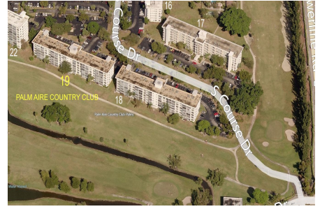
Built in 1971 - 60 units - 6 floors

Palm Aire Condo Assoc-Bldg 19 2691 S Course Dr Pompano Beach FL 33069 954-970-0973