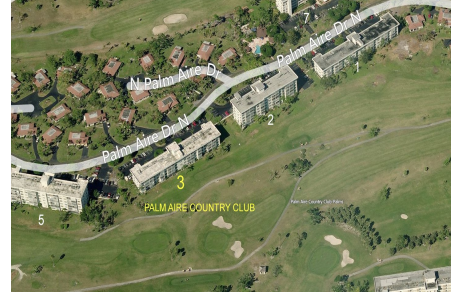
Built in 1973 - 40 units - 4 floors

Palm Aire Association Bldg 3 2851 S Palm Aire Dr, Pompano Beach, FL 33069 (954) 642-7363