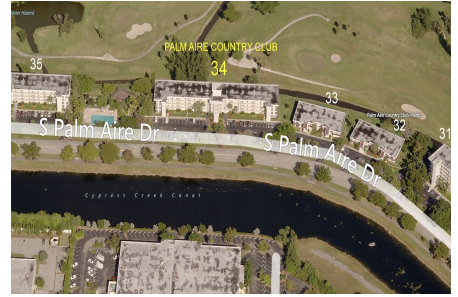
Built in 1973 - 40 units - 4 floors

Mwi/Campbell Management Co, Palm Aire Country Club Condominium Association 3500 Gateway Drive # 202 Pompano Beach, FL 33069-4870 (954) 968-4481