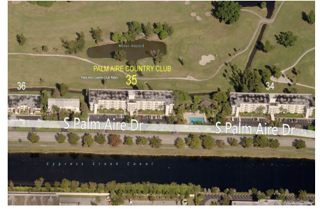
Built in 1973 - 40 units - 4 floors

Mwi/Campbell Management Co, Palm Aire Country Club Condominium Association 3500 Gateway Drive # 202 Pompano Beach, FL 33069-4870 (954) 968-4481