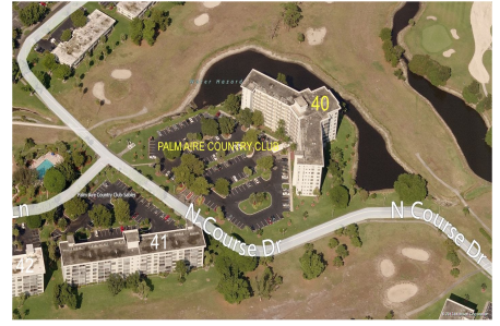
Built in 1974 - 107 units - 9 floors

Number of units: 107 Number of active listings for rent: 0 Number of active listings for sale: 6 Building inventory for sale: 5% Number of sales over the last 12 months: 0 Number of sales over the last 6 months: 0 Number of sales over the last 3 months: 0