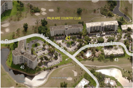
Built in 1974 - 60 units - 6 floors

Mwi/Campbell Management Co, Palm Aire Country Club Condominium Association 3500 Gateway Drive # 202 Pompano Beach, FL 33069-4870 (954) 968-4481