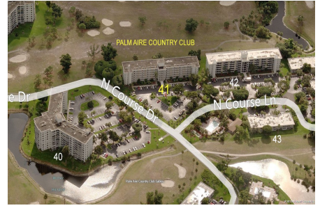
Built in 1974 - 60 units - 6 floors

Number of units: 60 Number of active listings for rent: 0 Number of active listings for sale: 3 Building inventory for sale: 5% Number of sales over the last 12 months: 2 Number of sales over the last 6 months: 1 Number of sales over the last 3 months: 1