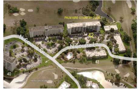
Built in 1974 - 60 units - 6 floors

Mwi/Campbell Management Co, Palm Aire Country Club Condominium Association 3500 Gateway Drive # 202 Pompano Beach, FL 33069-487 (954) 968-4481