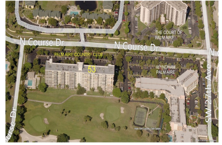
Built in 1983 - 100 units - 10 floors

Number of units: 100 Number of active listings for rent: 0 Number of active listings for sale: 2 Building inventory for sale: 2% Number of sales over the last 12 months: 5 Number of sales over the last 6 months: 3 Number of sales over the last 3 months: 2