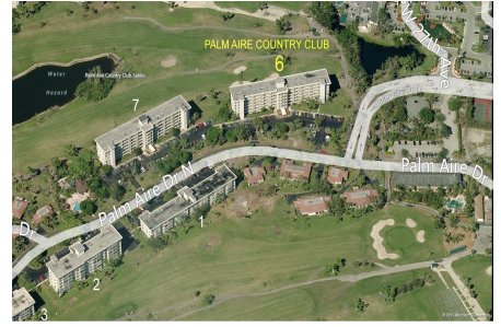
Built in 1970 - 60 units - 6 floors

Number of units: 60 Number of active listings for rent: 0 Number of active listings for sale: 3 Building inventory for sale: 5% Number of sales over the last 12 months: 2 Number of sales over the last 6 months: 2 Number of sales over the last 3 months: 1