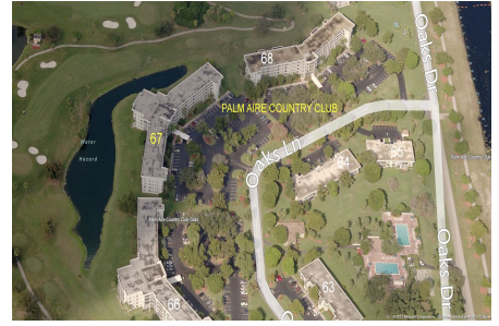
Built in 1979 - 59 units - 5 floors

Number of units: 59 Number of active listings for rent: 0 Number of active listings for sale: 2 Building inventory for sale: 3% Number of sales over the last 12 months: 5 Number of sales over the last 6 months: 5 Number of sales over the last 3 months: 1