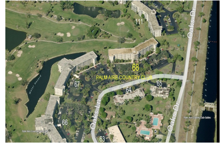
Built in 1980 - 50 units - 5 floors

Mwi/Campbell Management Co, Palm Aire Country Club Condominium Association 3500 Gateway Drive # 202 Pompano Beach, FL 33069-4870 (954) 968-4481