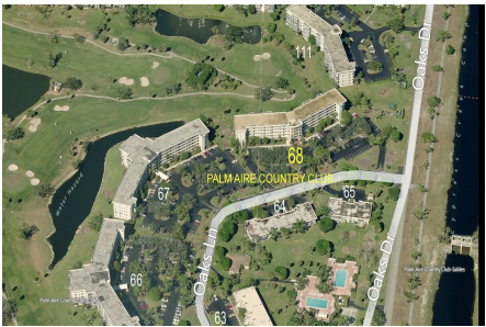
Built in 1980 - 50 units - 5 floors

Mwi/Campbell Management Co, Palm Aire Country Club Condominium Association 3500 Gateway Drive # 202 Pompano Beach, FL 33069-4870 (954) 968-4481