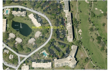
Built in 1977 - 50 units - 5 floors

Number of units: 50 Number of active listings for rent: 0 Number of active listings for sale: 3 Building inventory for sale: 6% Number of sales over the last 12 months: 4 Number of sales over the last 6 months: 1 Number of sales over the last 3 months: 1