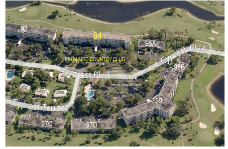
Built in 1980 - 50 units - 5 floors

Number of units: 50 Number of active listings for rent: 0 Number of active listings for sale: 1 Building inventory for sale: 2% Number of sales over the last 12 months: 2 Number of sales over the last 6 months: 1 Number of sales over the last 3 months: 1