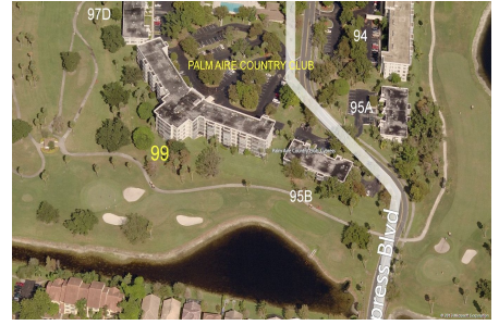
Built in 1980 - 59 units - 5 floors

Mwi/Campbell Management Co, Palm Aire Country Club Condominium Association 3500 Gateway Drive # 202 Pompano Beach, FL 33069-4870 (954) 968-4481