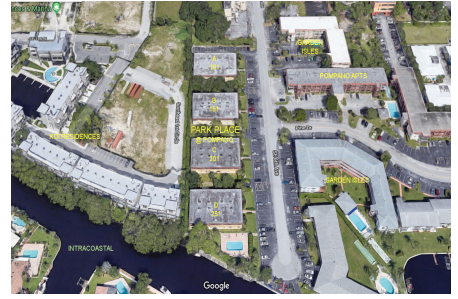
Built in 2006 - 64 units - 2 floors

Park Place Owners Association Inc Address: 1350 St Charles Pl, Pembroke Pines, FL 33026 Phone: +1 954-431-4007 http://www.parkplaceowners.com/wp/