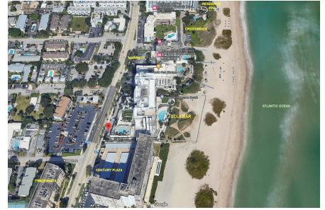
Built in 2023 - 99 units - 21 floors