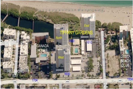
Built in 1969 - 65 units - 13 floors

Tiffany Gardens East 1600 N Ocean Blvd Pompano Beach, FL - Broward County (954) 781-0430