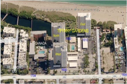
Built in 1970 - 65 units - 13 floors

Tiffany Gardens North Building 1600 N Ocean Blvd, Pompano Beach, FL 33062 (954) 781-0430