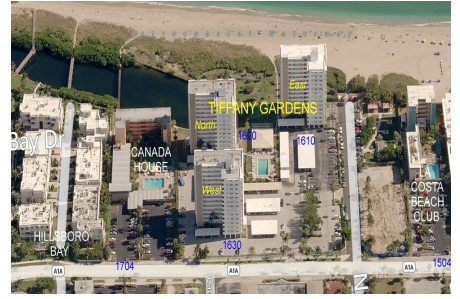
Built in 1970 - 65 units - 13 floors

Tiffany Gardens North Building 1600 N Ocean Blvd, Pompano Beach, FL 33062 (954) 781-0430