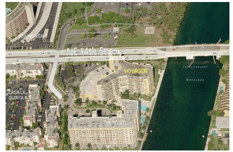
Built in 1982 - 129 units - 10 floors

Voyager Condominium Association 2900 NE 14th St Cswy, Pompano Beach, FL 33062 (954) 781-8499