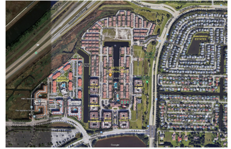
Built in 2009/2019 - 478 units - 4 floors

Artesia Master Association Inc 12550 NW 29th Mnr Sunrise, FL 33323 (954) 514-1045