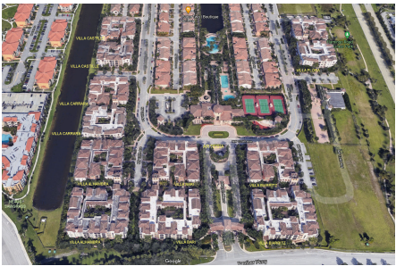
Built in 2007 - 52 units - 4 floors

Artesia Master Association Inc 12550 NW 29th Mnr Sunrise, FL 33323 (954) 514-1045