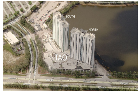
Built in 2009 - 198 units - 26 floors