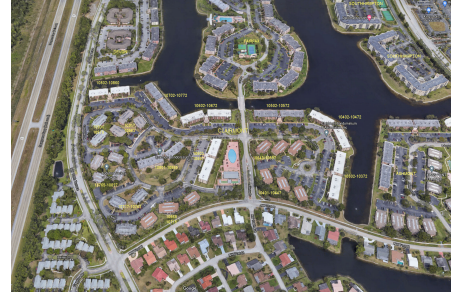
Built in 1989 - 444 units - 3 floors

Kings Point 7620 Nob Hill Road, Tamarac, FL 33321 Tel. (954)726-4120