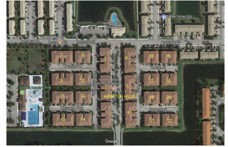
Built in 2006 - 196 units - 2 floors

Hampton Hills Community Association 5753 Hampton Hills Blvd Tamarac, FL 33321 (954) 720-1109 http://www.myhamptonhills.com/