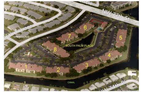
Built in 2006 - 208 units - 3 floors