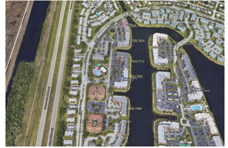
Built in 1994 - 368 units - 4 floors

Kings Point in Tamarac 7620 Nob Hill Road, Tamarac, FL 33321 Tel. (954)726-4120